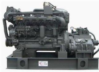
50Kw~250KW Marine Diesel Generator