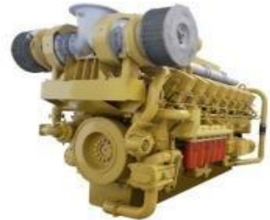
1000KW Marine Diesel Engine & Generator.