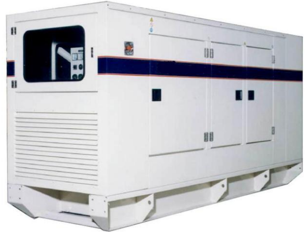
Soundproof Canopy Diesel Generator (100Kw~2000KVA)