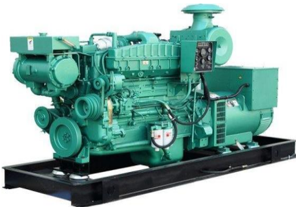
50Kw~880Kw Marine Generator